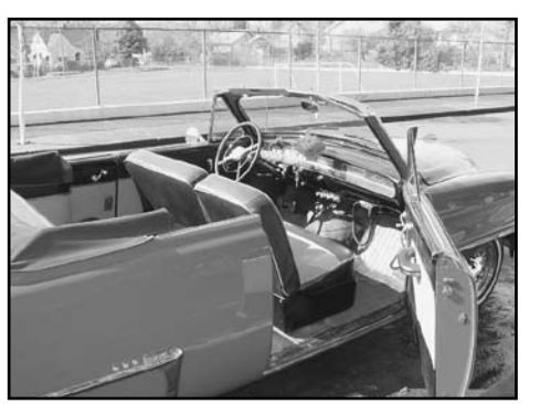
Don and Norma's 1953 Plymouth Cranbrook Convertible, nice interior.