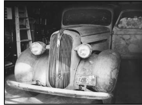
The '37 PT50 Before Restoration

Ray is almost finished with a complete frame-off restoration of the '37, with the help of Norm