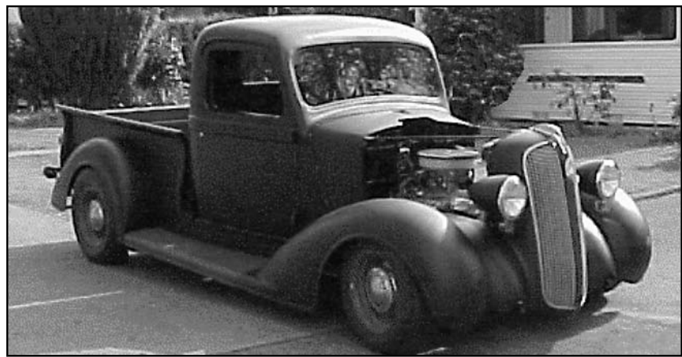
Raymond and Virginia Dunn's '37 PT50 Plymouth Pickup

Nice job so far and good luck on the rest of the restoration. We hope to see your '37 at club meetings and events.