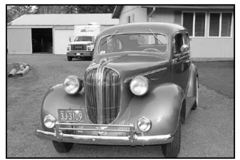
The front profile of the '38 is striking.

The only major alteration to the card had been a rear-end ratio change from 4.0 to 3.55 using